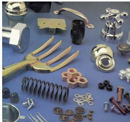
Recubrimientos Metálicos de México provides a wide variety of finishing services. This photo shows some of the components finished at the facility.